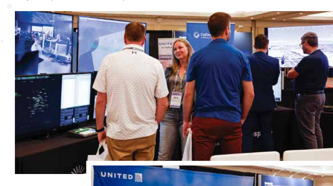
Exhibit and sponsorship spportunities close on Monday, August 8, 2025.

Note that emails and print ads will need NATCA approval before publishing.