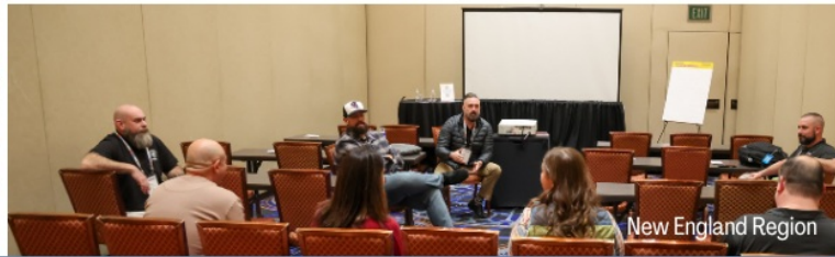
New England Region