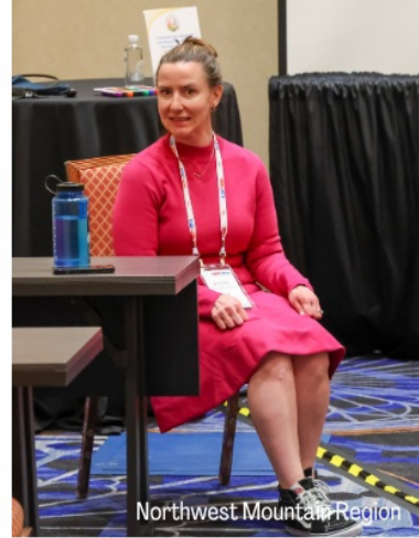
Northwest Mountain Region