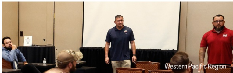
Western Pacific Region