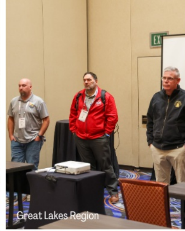
Great Lakes Region